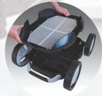
Easy operation and clean