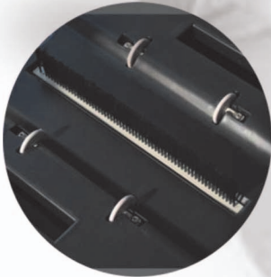
Equipped with small wheels and brush