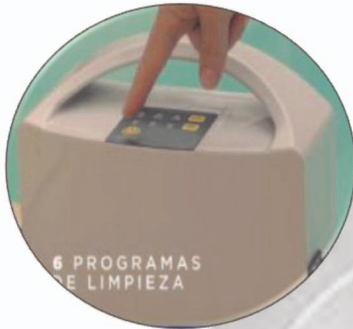
3 cleaning cycles

Thanks to its big power, it can overcome the obstacles in the pool floor without any difficulty