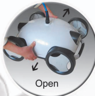
Easy open by 2 clips