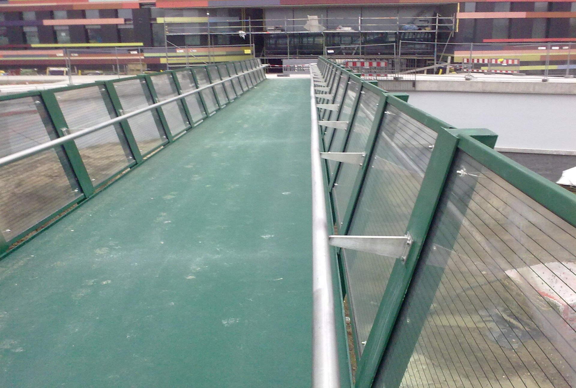
HAMBURG, GERMANY, 2012 800 m2