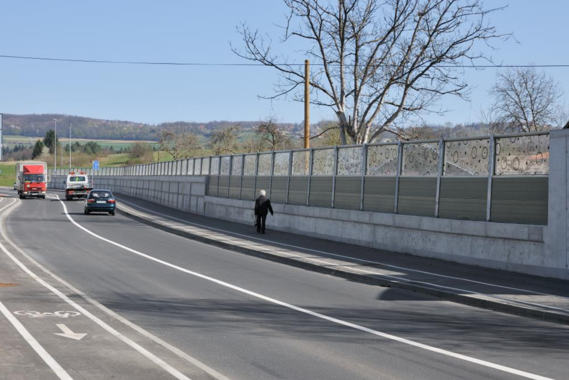
NOVO MESTO, SLOVENIA 2011