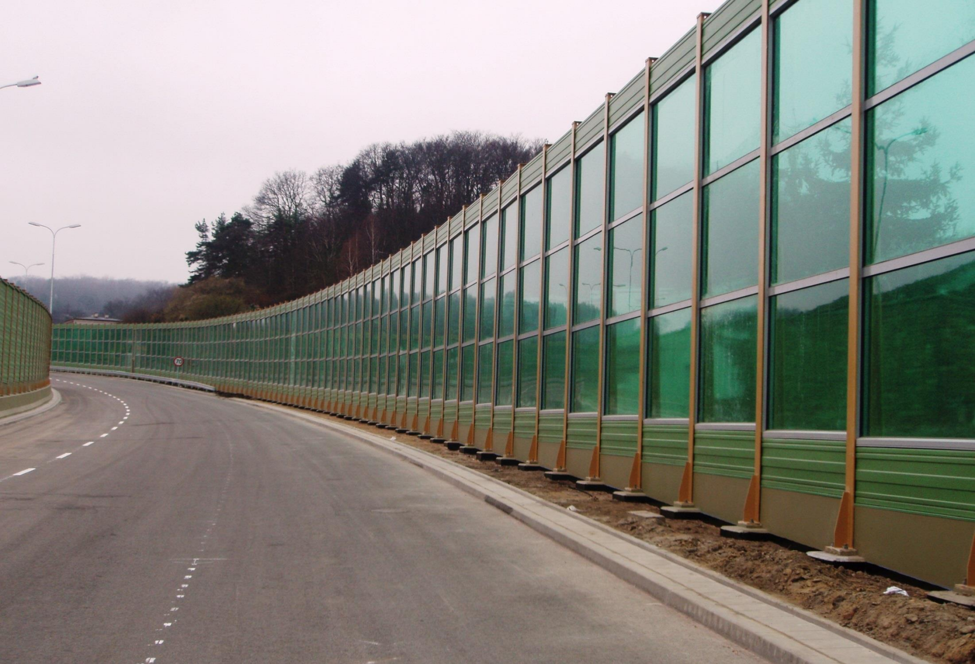
GDYNJA, POLAND, 2009 6.500 m 2