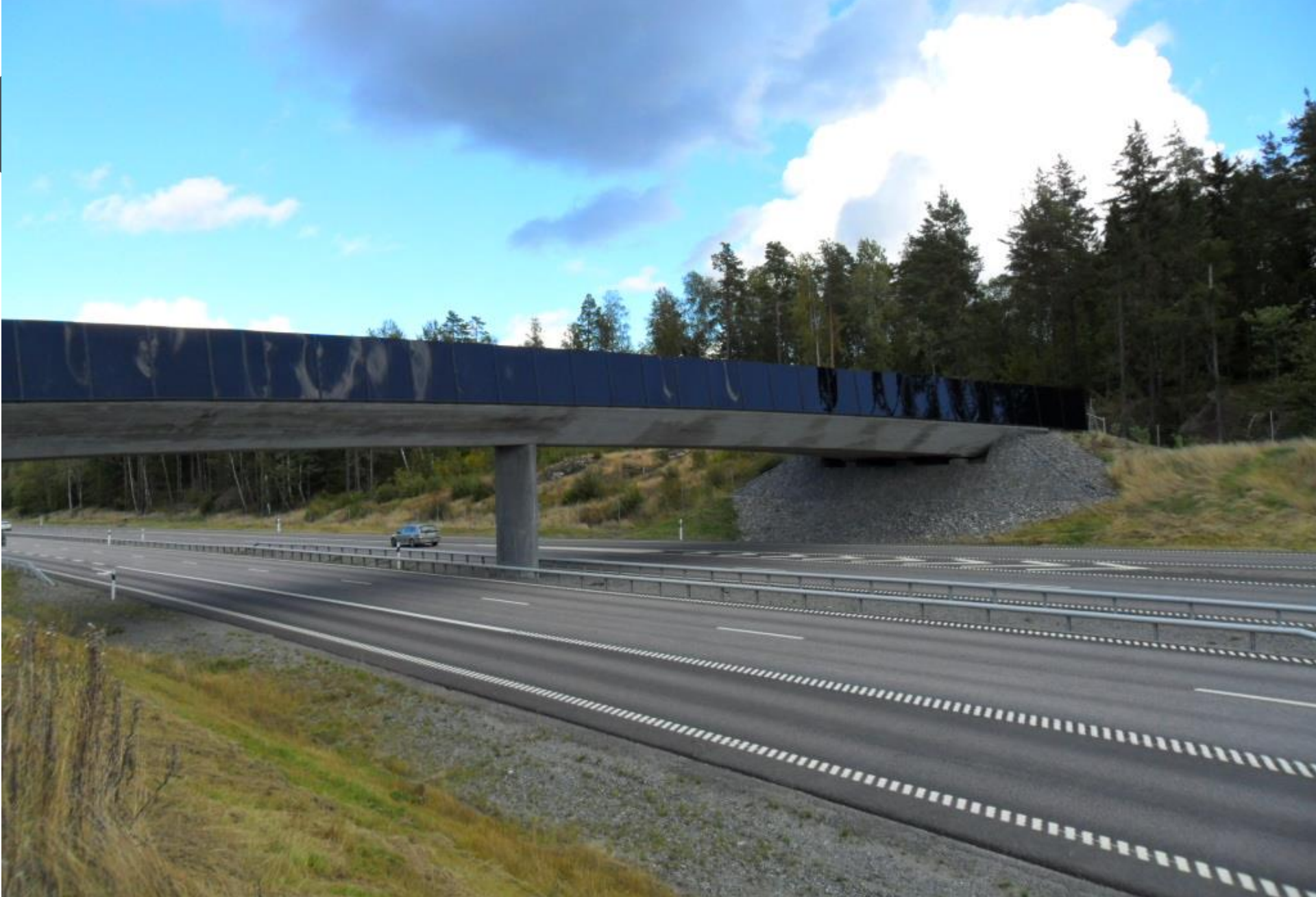
STOCKHOLM, SWEDEN, 2011