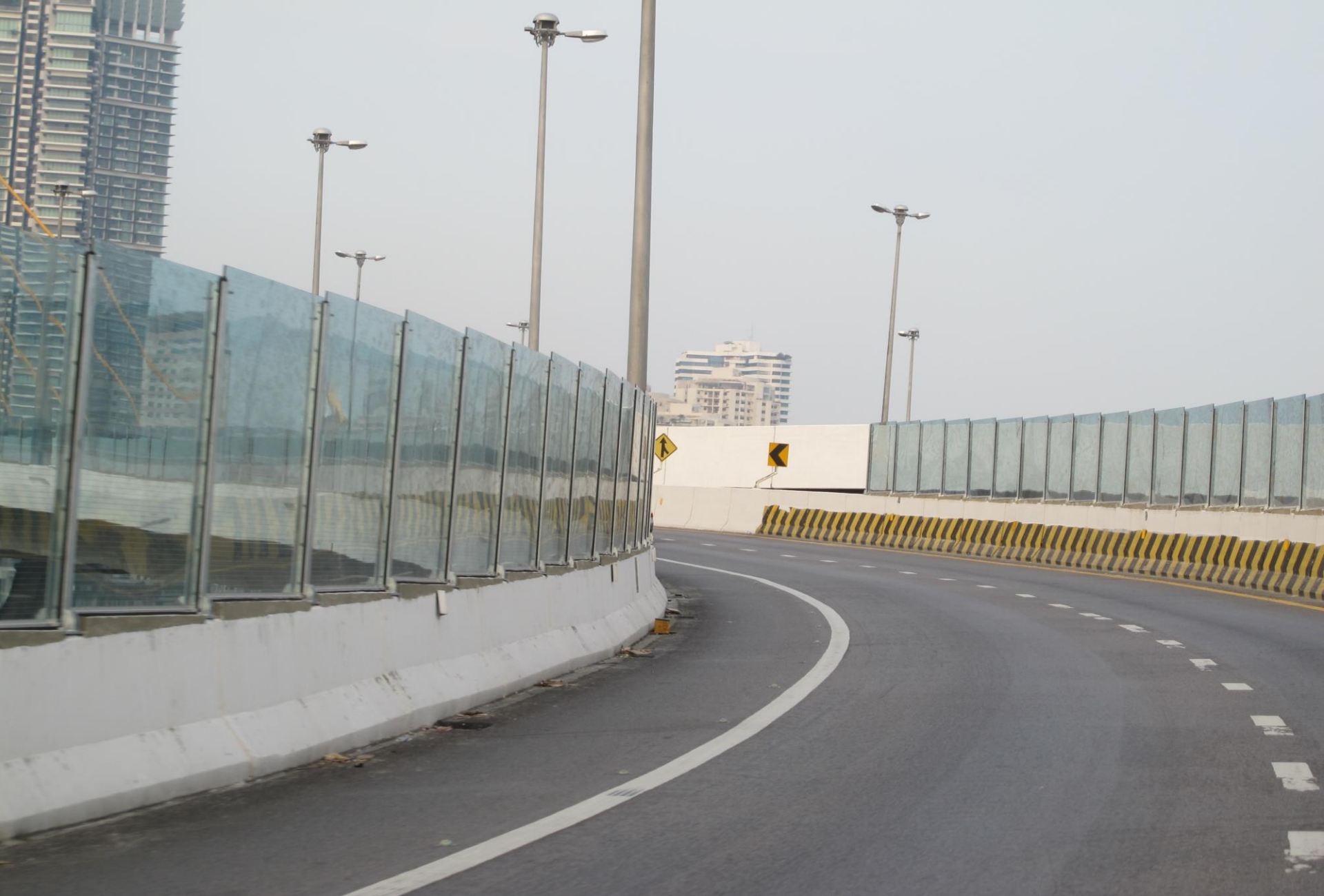
BANGKOK, THAILAND, 2014