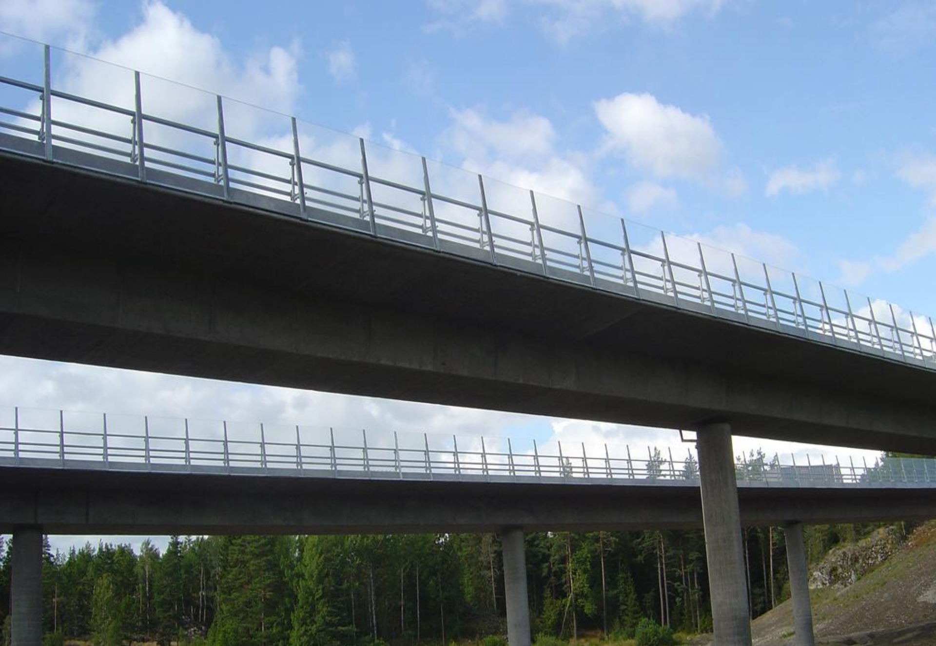
SOTHOLMEN, SWEDEN, 2009