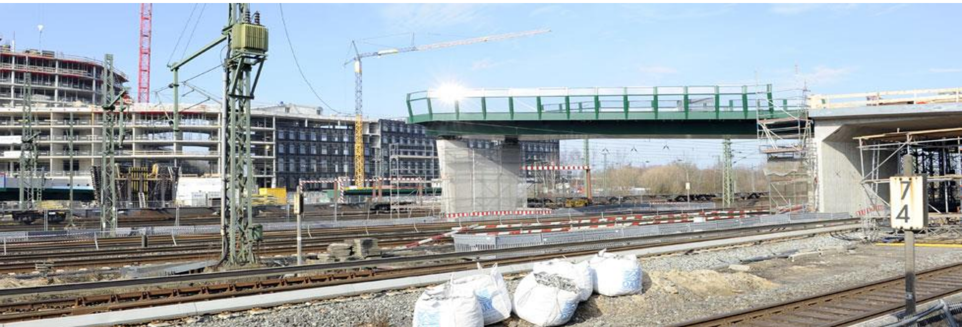
HAMBURG, GERMANY, 2012 800 m 2