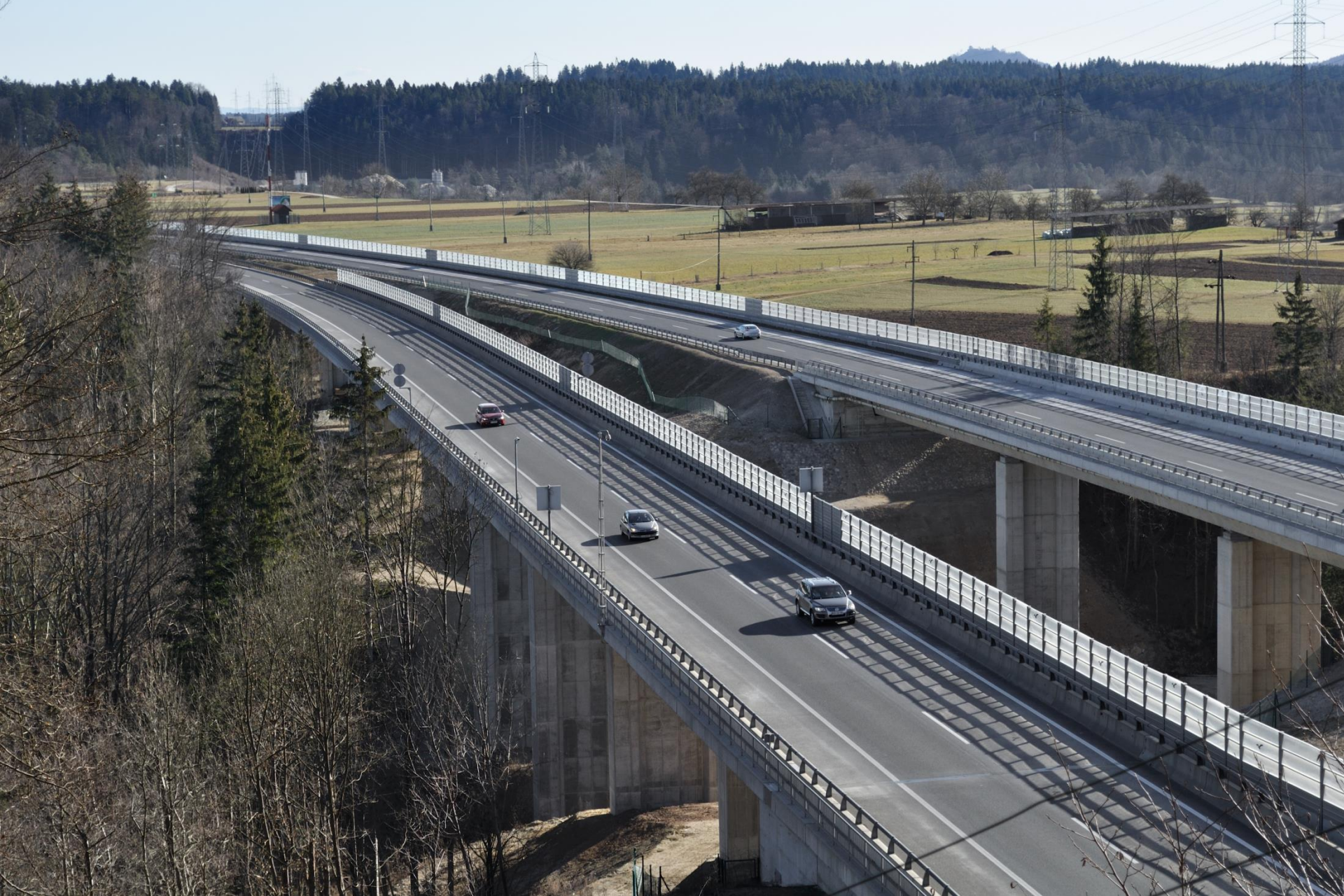
PODTABOR, SLOVENIA, 2011