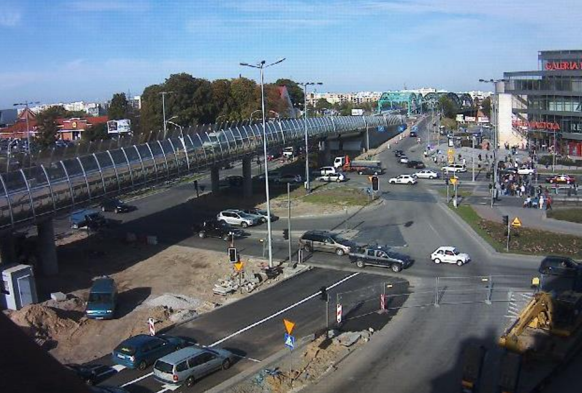
GDANSK, POLAND, 2012 8.500 m2