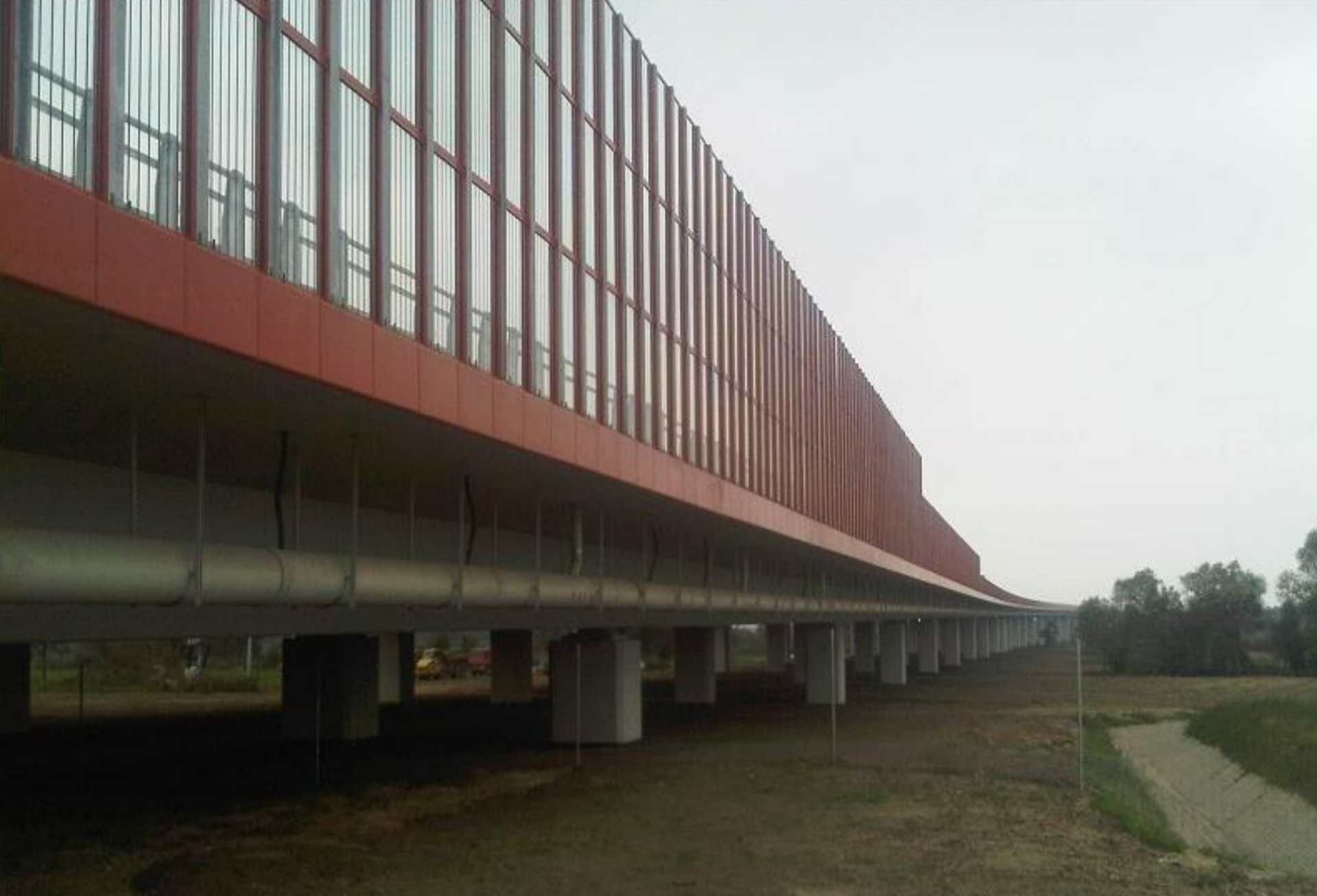
A1 PIATEK - KOTLIKA, POLAND, 2012 11.500 m 2