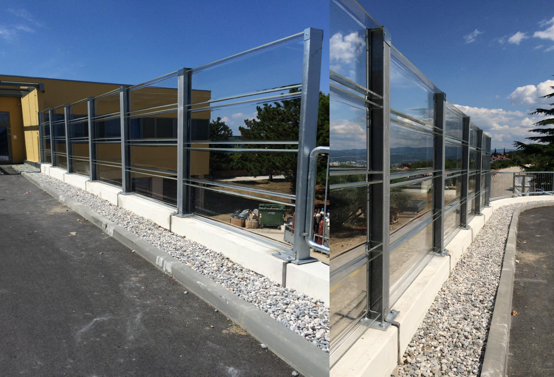
KOPER, SLOVENIA, 2017