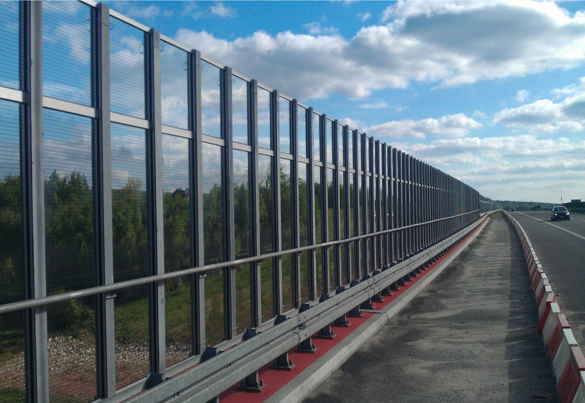
KIELCE, POLAND, 2012 4.300 m 2