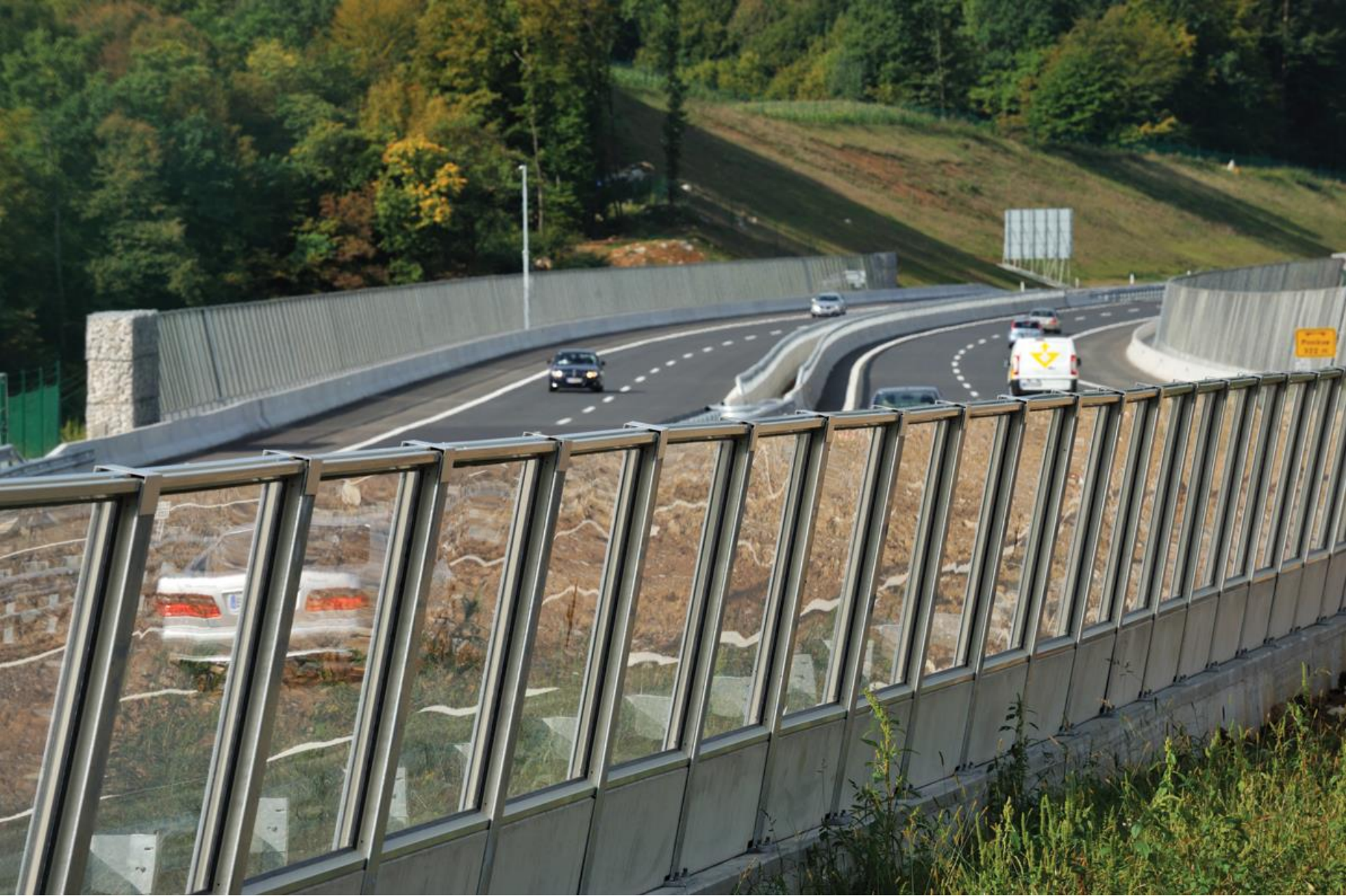
TREBNJE, SLOVENIA, 2010