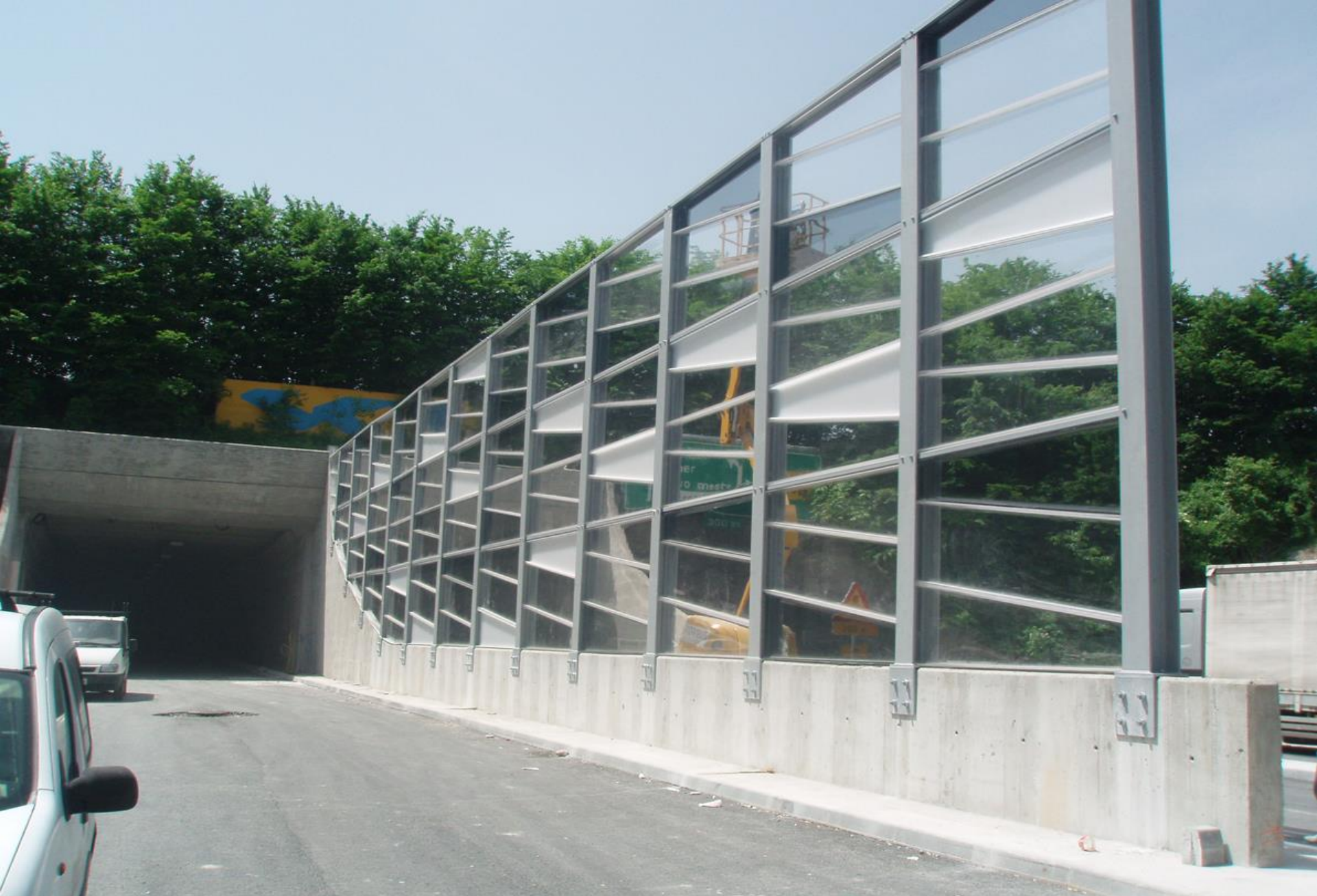
LJUBLJANA, SLOVENIA, 2008