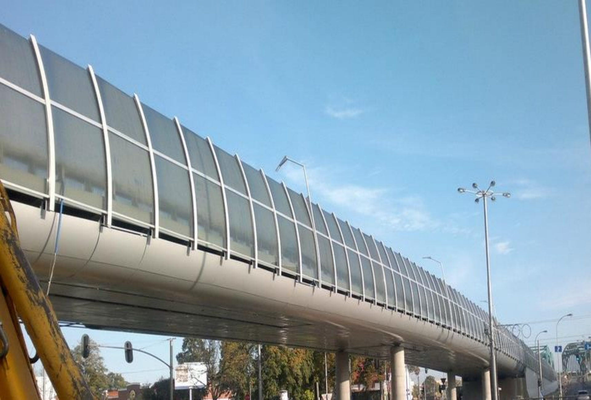
GDANSK, POLAND, 2012 8.500 m 2