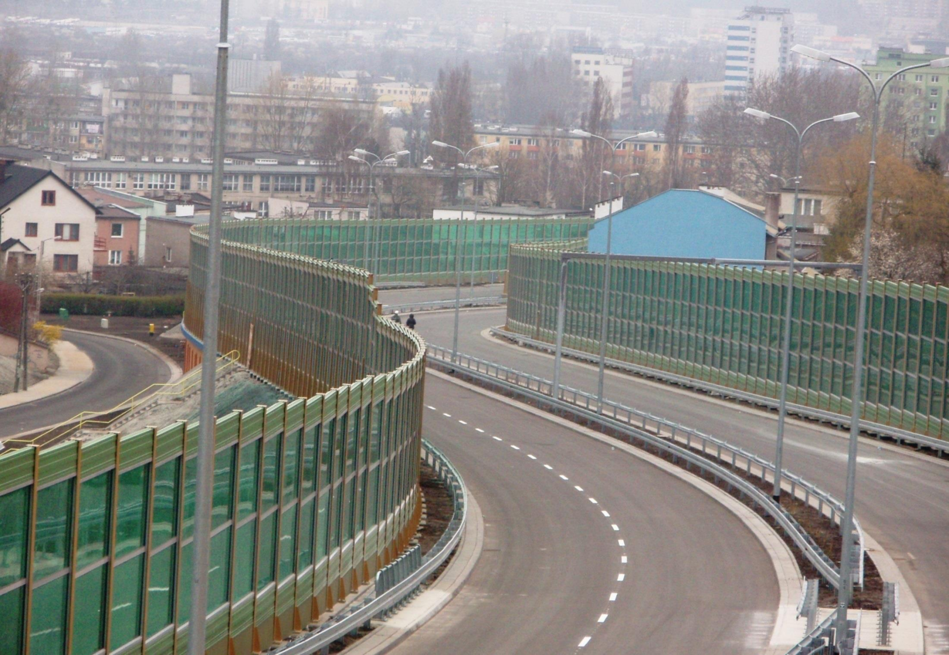
GDYNJA, POLAND, 2009 6.500 m 2