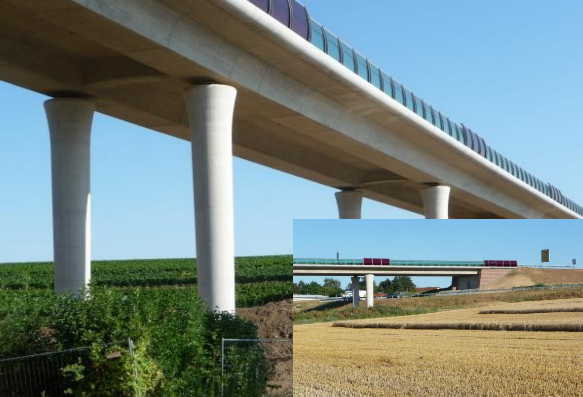
ECKBACHTALBRÜCKE, GERMANY, 2018