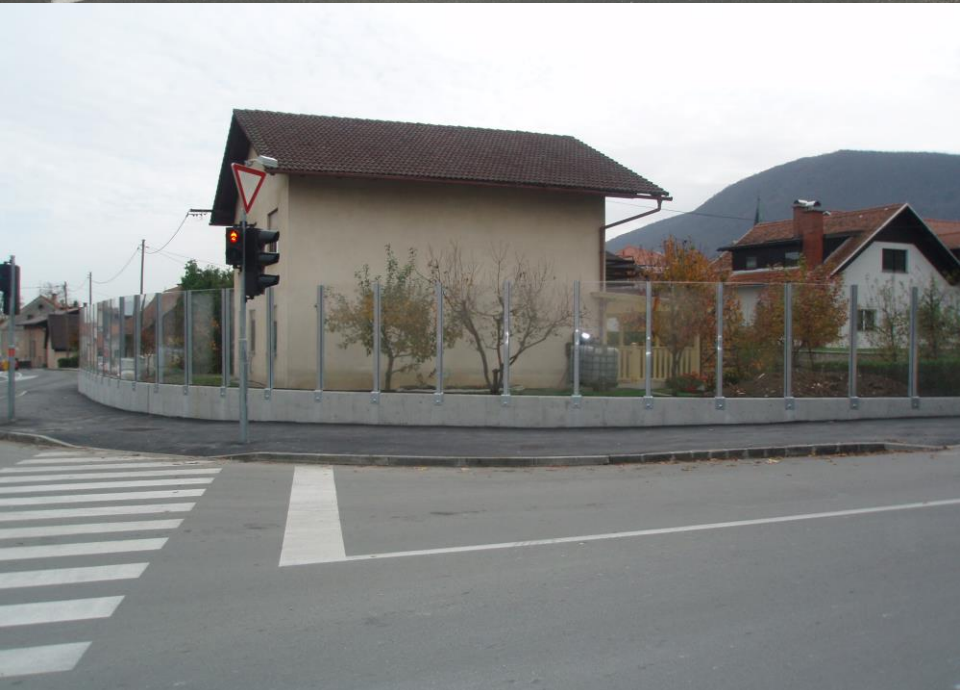
LOCAL BARRIERS, SLOVENIA