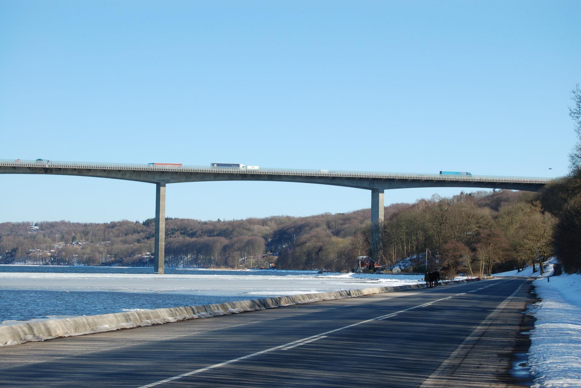
VEJLE, DENMARK, 2013