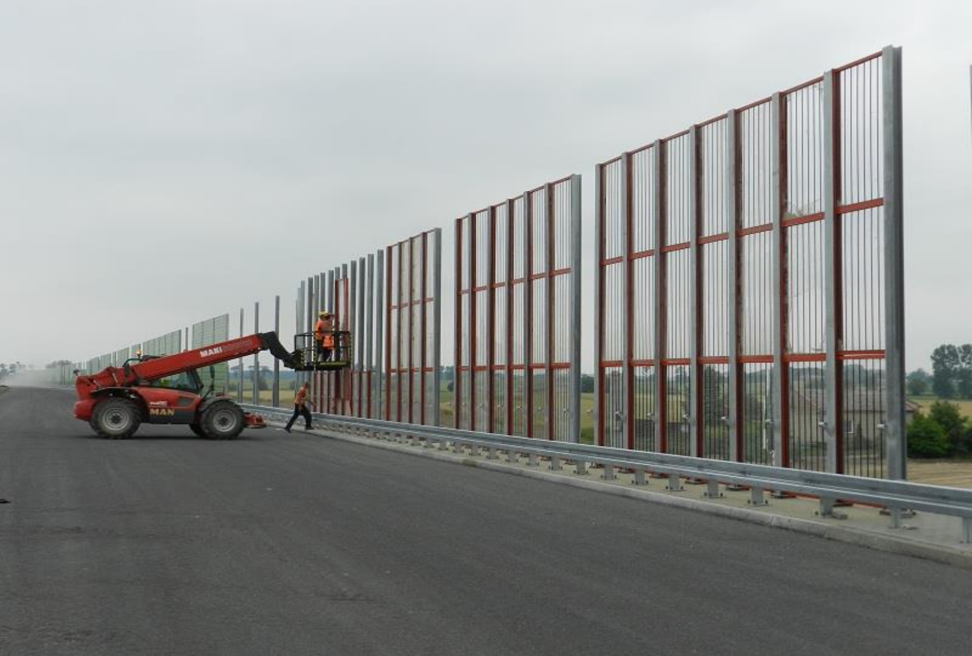
A1 PIATEK - KOTLIKA, POLAND, 2012 11.500 m 2