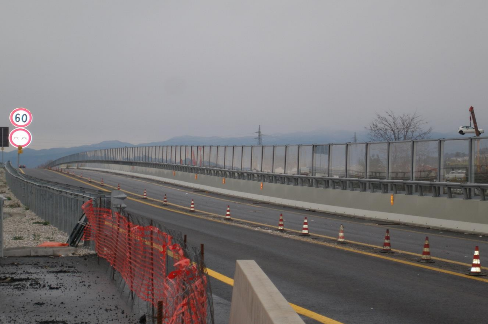
GORIZIA, ITALY, 2012 3.500 m 2