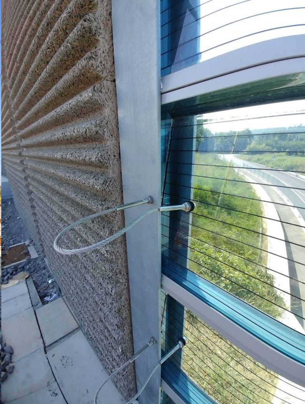
KOPER, SLOVENIA, 2018