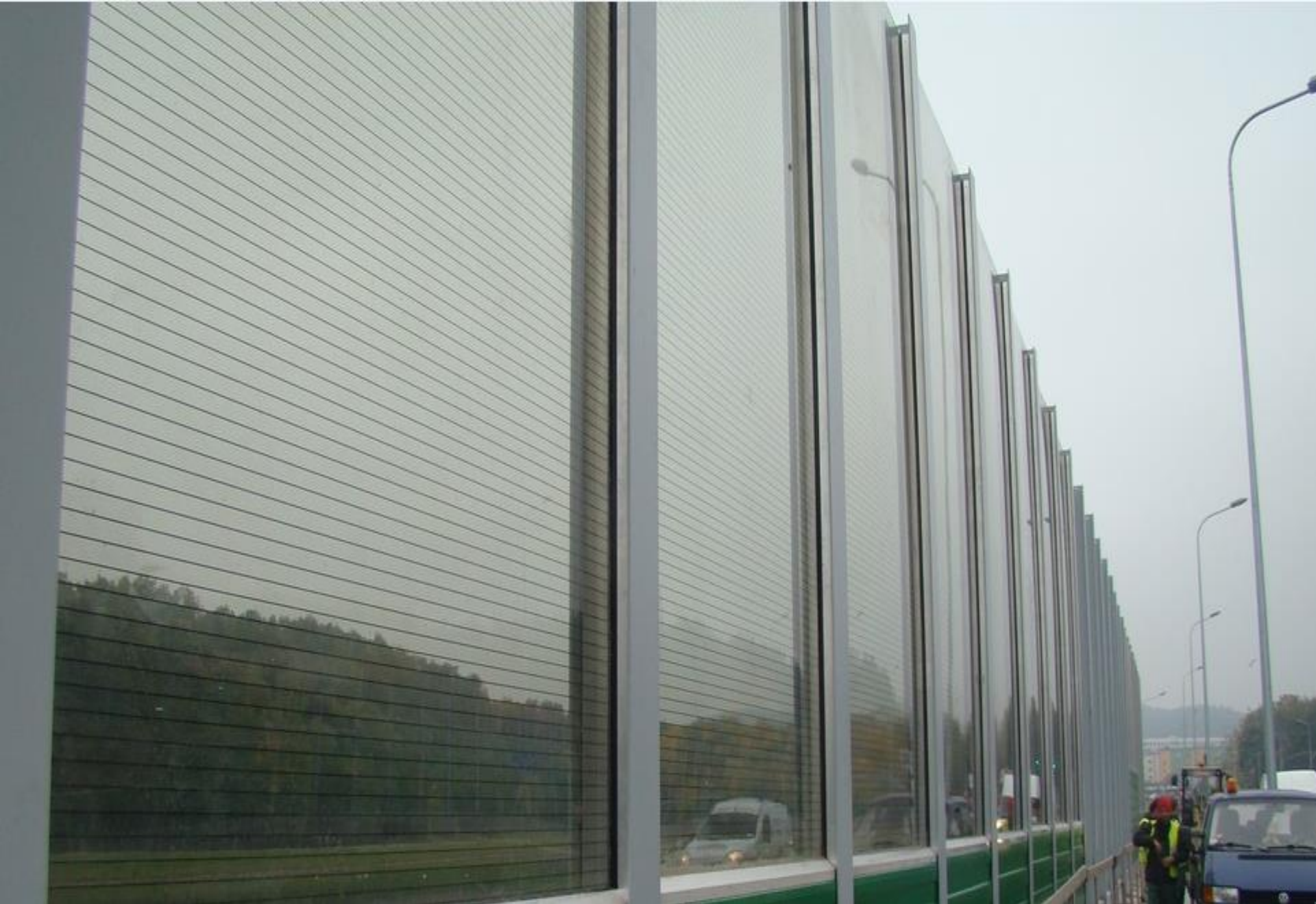
GDANSK, POLAND, 2012 8.500 m 2