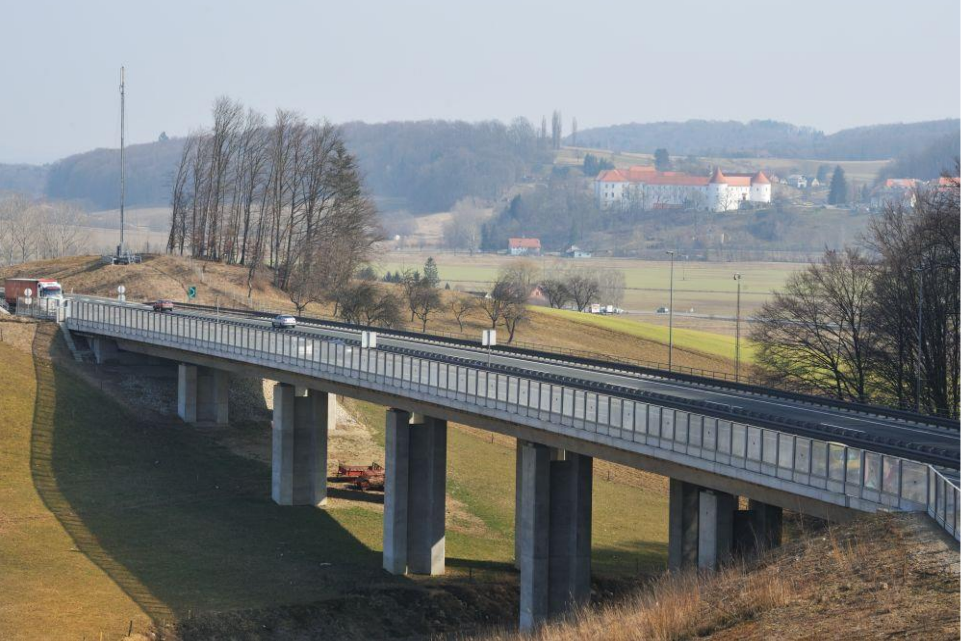
PESNICA, SLOVENIA, 2011