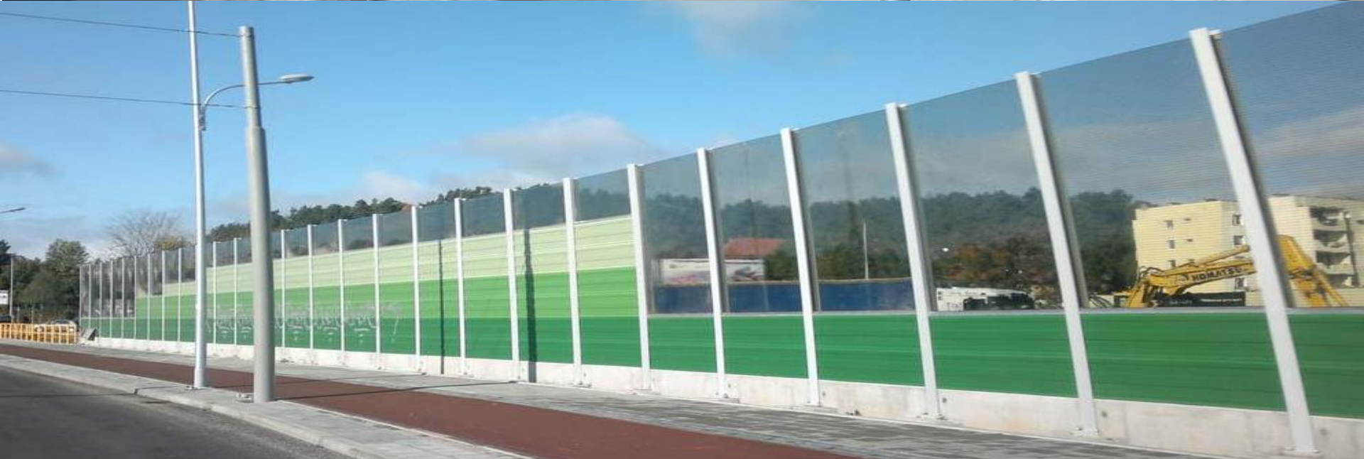
GDANSK, POLAND, 2012 8.500 m 2