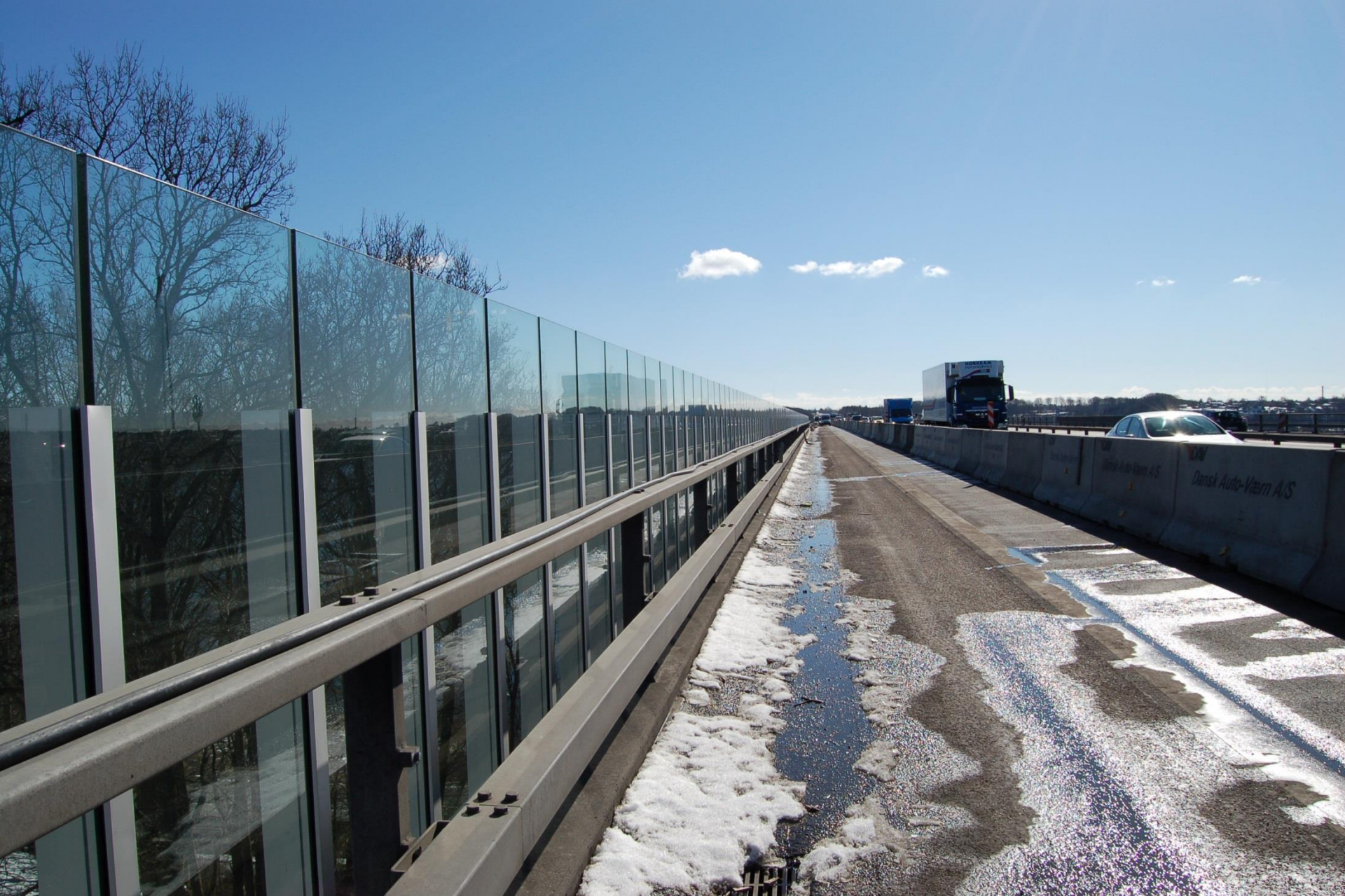
VEJLE, DENMARK, 2013