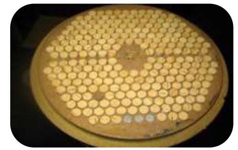
Badly pitted and corroded tube sheets and end plates can be rebuilt to original OEM specifications using 201 Ceramic Repair Paste