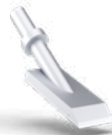
E10107 CHISEL 50 MM