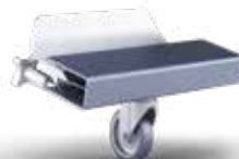
E13542 BLADE PROTECTION WITH SWIVEL WHEEL