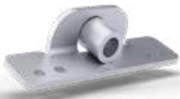
E10106 CHISEL HOLDER