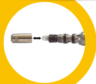
快接头设计 Quick Connector design

Chuck type: Push Button Working pressure: 0.22-0.3Mpa Rotation speed: \geq 350,000 R.P.M. Bur applicable: \Phi 1.595-\Phi 1.600 mm Spray: Four Water spray Noise < 50 dB LED luminous intensity: \geq 1500 LUX Grip power: 24-45N