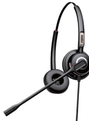
Fanvil - HT202