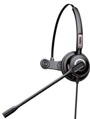
Fanvil - HT201

Fanvil HT201 & HT202 offer a range of premium quality headsets using Fanvil's innovative acoustic technology to deliver speech clarity and an excellent audio experience. Coupled with our sleek design that focuses on comfort and durability, the Fanvil HT201 & HT202 headset offers a new level of experience for call center professionals.