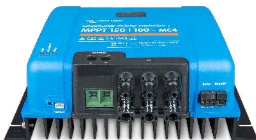
SmartSolar Charge Controller MPPT 150/100-MC4 without display