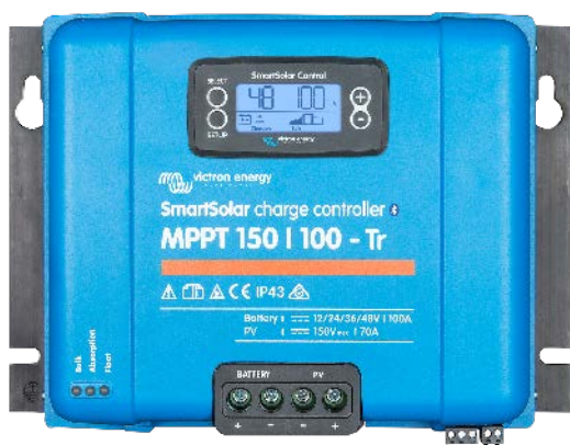
SmartSolar Charge Controller MPPT 150/100-Tr with pluggable display