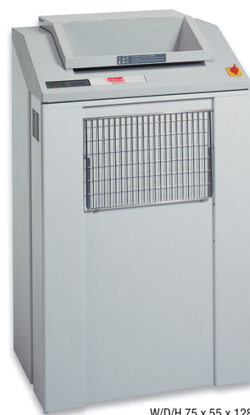
W/D/H 75 x 55 x 128 cm