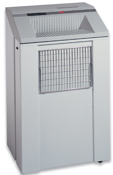
W/D/H 70 x 55 x 112 cm