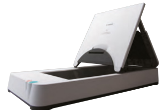
A4 Flatbed Scanner Unit 101