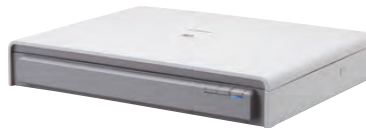
A3 Flatbed Scanner Unit 201

Scan bound books, journals and fragile media by adding the Flatbed Scanner Unit 101 for documents up to A4 or Flatbed Scanner Unit 201 for A3 scanning. Connected by USB, these flatbed scanners work seamlessly with the DR-M140 in a smooth dual-scanning operation that lets you apply the same image enhancement features to any scan.