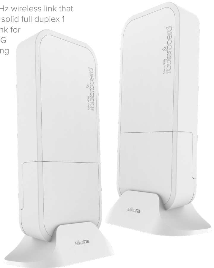
2x plastic straps Table stand

The box includes a wall mounting kit, straps for pole mounting and also a pair of table stands for using the devices indoors. Penetrates some windows depending on material. For more products and information please visit mikrotik.com !