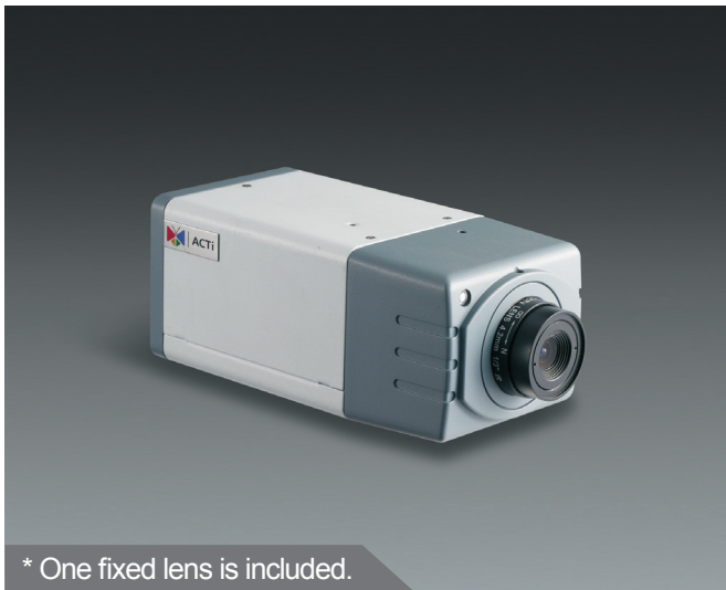
* One fixed lens is included.