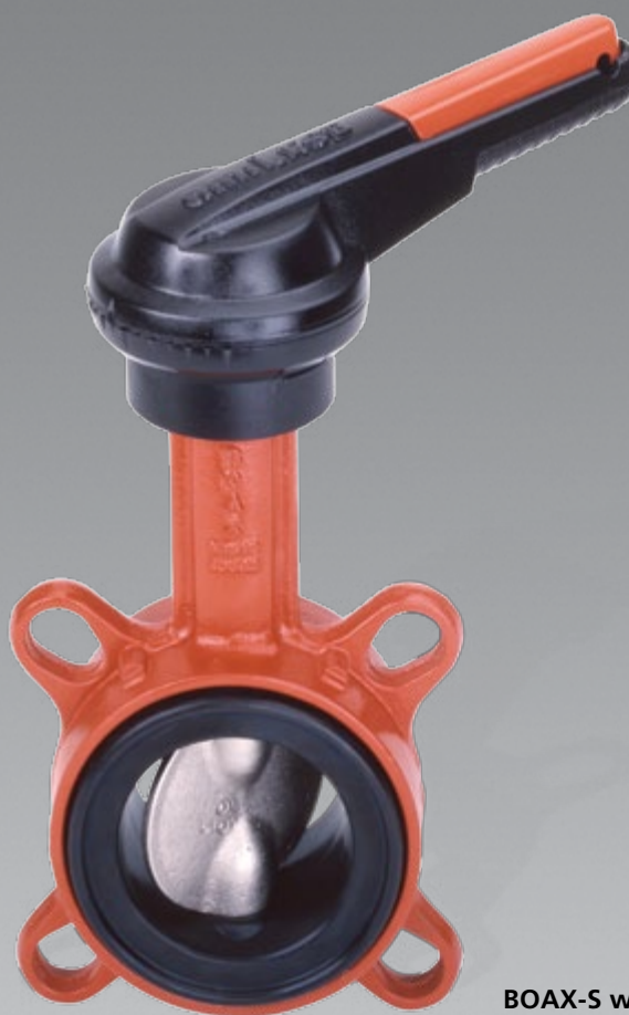
BOAX-S with LP lever