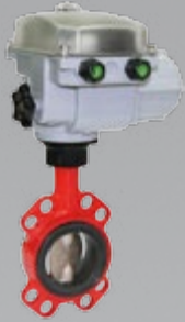
BOAX-S with gearbox MA